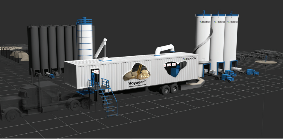
FIGURE 1. The Voyager unit offers operational efficiencies, short manufacturing time and advanced chemistries in a small footprint.

The Voyager resin-coating service utilizes a mobile unit the size of a tractor-trailer (Figure 1). The unit is used in combination with ancillary equipment such as silos, chemical storage and a mobile laboratory. The laboratory contains all the required testing equipment needed to ensure all products meet quality specifications. The total layout is configurable and scalable if